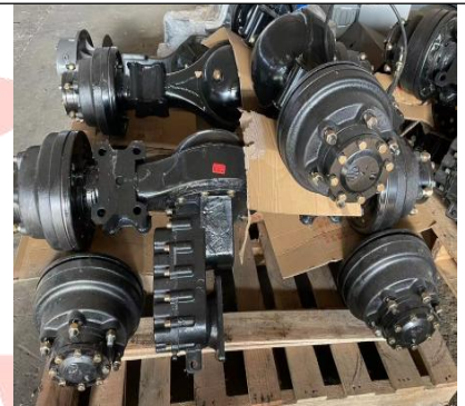
Axles with Reducer